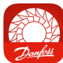
TurboTool™ app icon