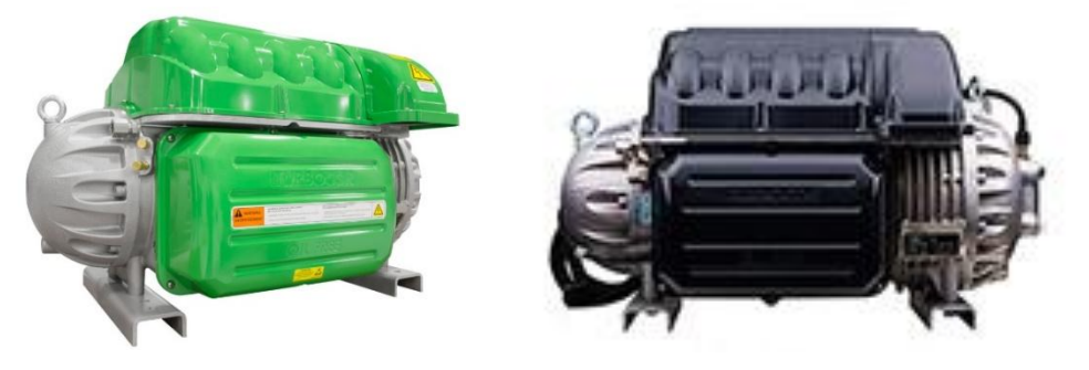
Figure 1 – TGS and TTS Compressor Examples

These compressors are equivalent to the compressors manufactured in Tallahassee, FL USA.