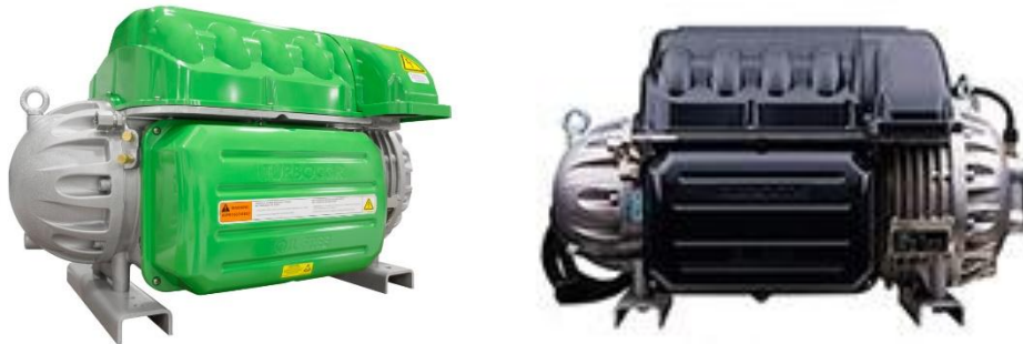
Figure 1 – TGS and TTS Compressor Examples

This update reflects our continued commitment to meeting global voltage requirements and expanding flexibility for our customers.